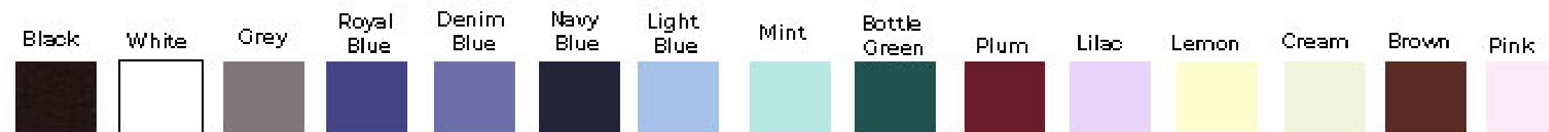
Colour range of plain poly cotton shirts