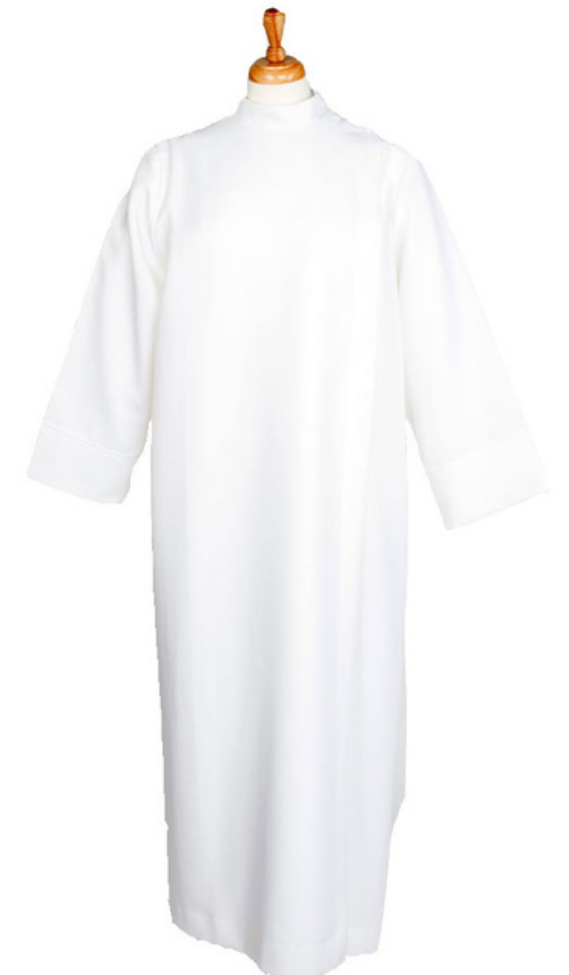
Cassock Alb £164