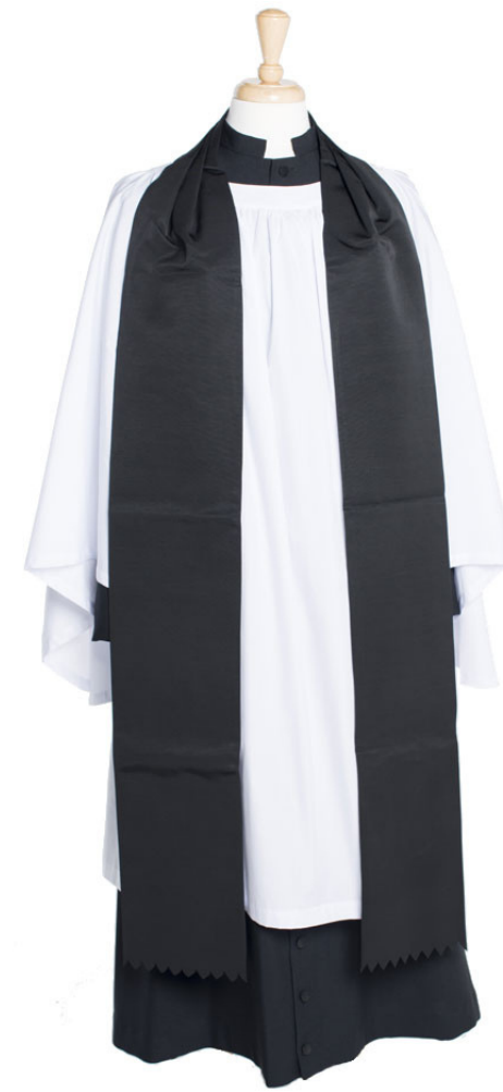
Preaching Scarf £62