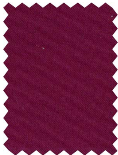
Red Purple All Wool Panama 9018 100% wool