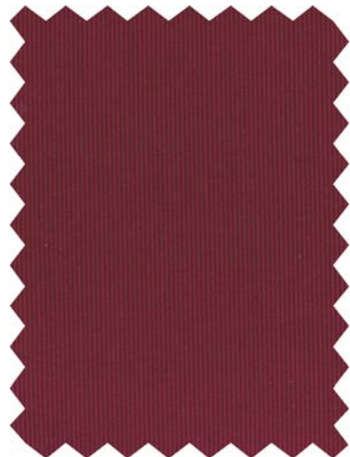
Red Purple Cotton Viscose 9578 52% Cotton / 48% Viscose