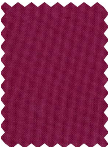
Red Purple Polyester Worsted 9987 55% polyester / 45% wool