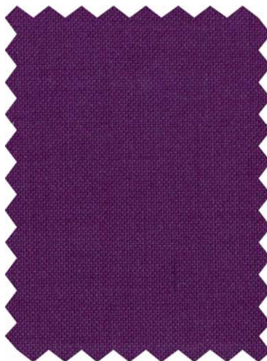
Blue Purple Polyester Worsted 9986 55% polyester / 45% wool