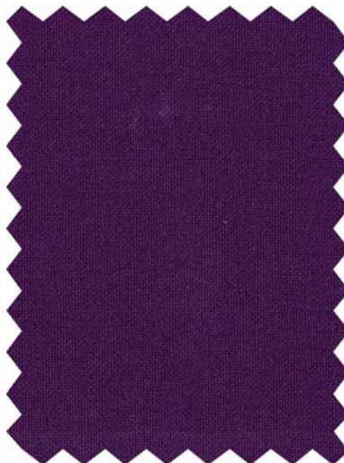
Blue Purple Polyester Panama 9998 100% polyester