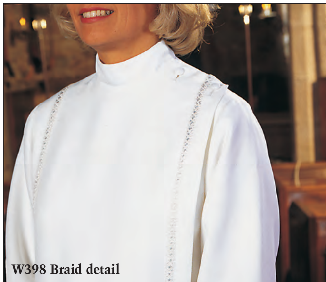
W398 Braid detail