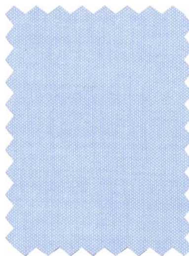
Pale Blue 9613