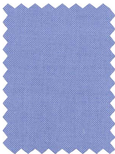
Mid Blue 9568